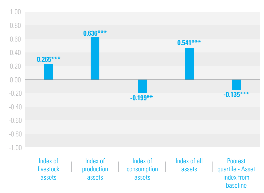
Figure 1: Impact of IN-SCT vs. PSNP alone on asset holdings